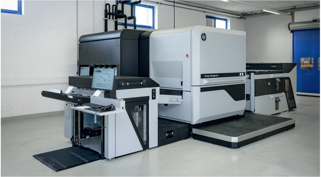
The 2nd HP Indigo has been in operation since May 2024